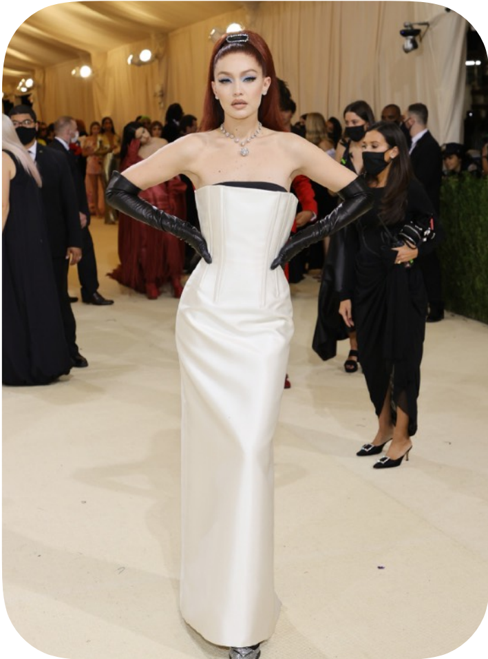
Gigi Hadid Prada